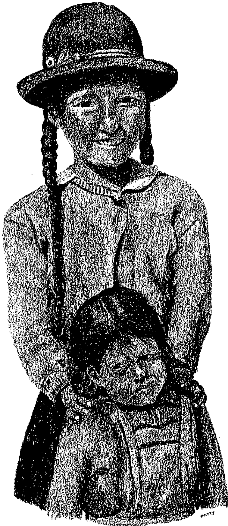
Dos indiecitas bolivianas